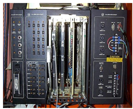
Processor Control Rack